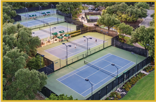
Tennis & Pickleball Courts